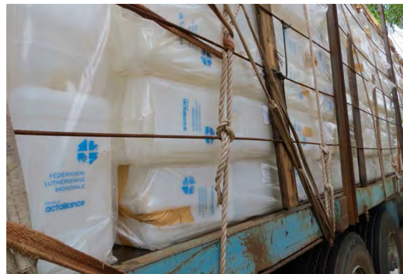
A truck carrying LWF/ACT Alliance water, health and sanitation kits for a distribution in Bouar, Central African Republic