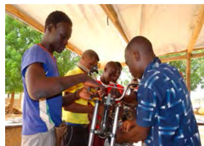
Mechanics training, VTC Goz-Beida.

The capacity building strategy also supports Income Generating Activities with microfinance schemes. Beneficiaries are granted small loans to develop businesses, helping them compensate the lack of revenue from the off agricultural season.