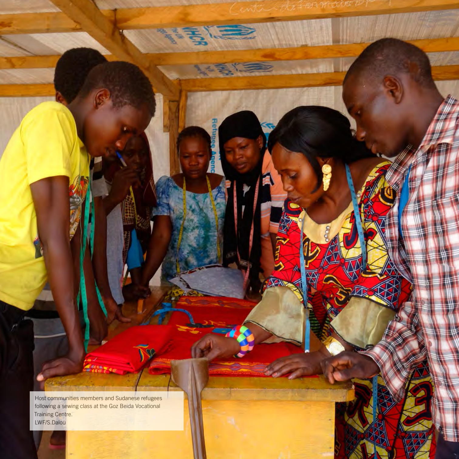
Host communities members and Sudanese refugees following a sewing class at the Goz Beida Vocational Training Centre.