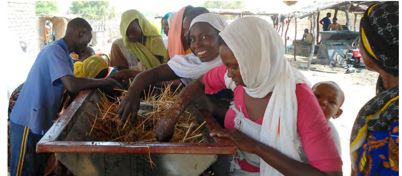
Beneficiaries are using one of the 5 presses installed in the Goz Beida intervention sites. These presses allow for the fabrication of combustible bricks thus offering an alternative to wood, this new source of energy contributes to the protection of local ecosystems.

To help populations in reaching self-reliance LWF Chad and its