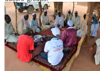
Meeting with local leaders.

LWF Chad has also developed irrigation systems in order to secure sufficient provision of water for producers' groups.