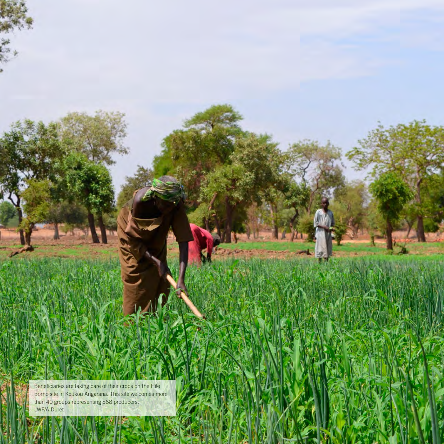
Beneficiaries are taking care of their crops on the Hile Borno site in Koukou Angarana. This site welcomes more than 40 groups representing 568 producers.