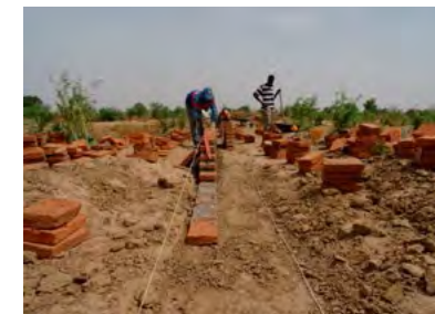
Irrigation s pipes' construction.

The irrigation systems are structured around traditional wells and offer a very limited outflow. They are also very fragile, highly dependent to fuel, and not durable as they rely on moto-pumps.